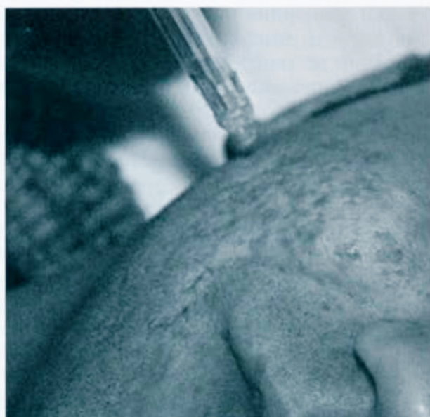
Figure 2.—Carbocaine perfusion by means of JetPeel™-3.