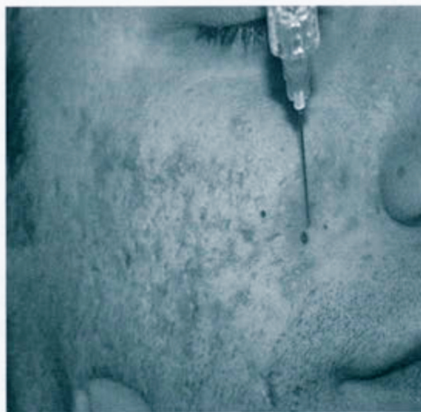
Figure 4.—Painless injection of hyaluronic acid by means of a 23-Gauge needle.