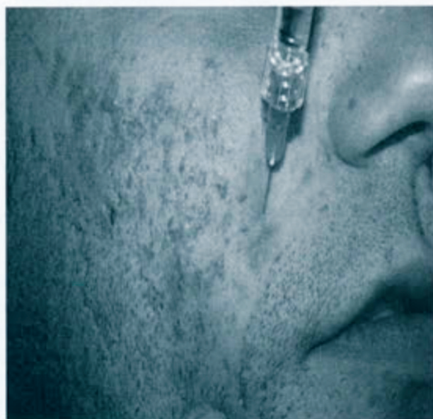
Figure 3.—Painless injection of hyaluronic acid with a 18-Gauge needle.